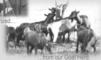
...from our Goat Herd.