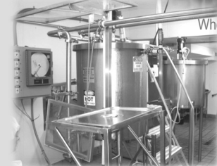
Whole Goat Milk in Glass Bottles...